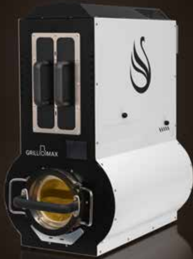
Elite Pages 15-16