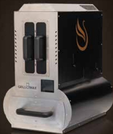
Advanced Pages 19-20