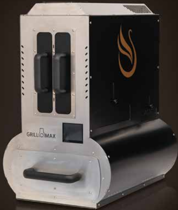
(* Design example)