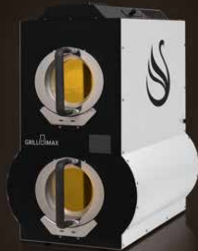
Duo Pom Pages 17-18